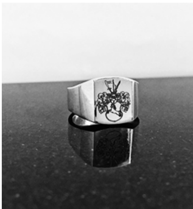
Signet ring model 2