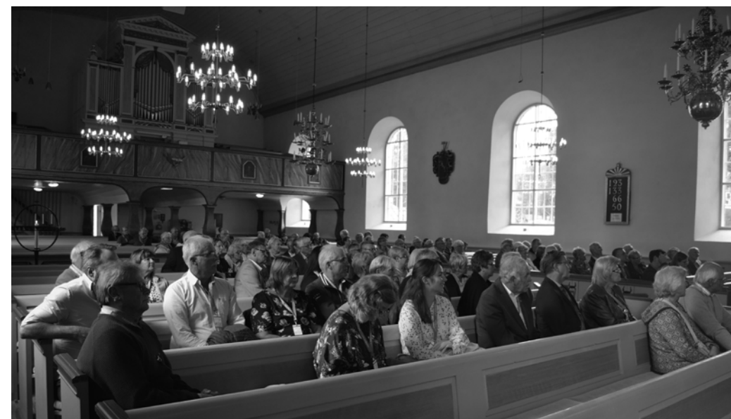
In the church there was a guide telling us about the many things that connects to the Sabelskjöld family. We didn't fill the church but there was family in almost every bench.