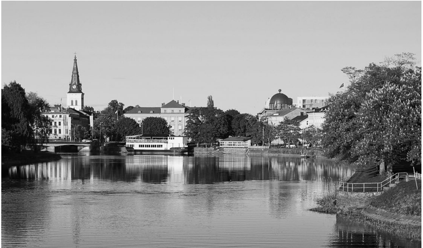
Karlstad blir samlingspunkten för vår nästa träff

Between our annual meetings, which are held every other year, we usually have a more informal “meeting”. During these meetings there is time and opportunity to talk about family matters with each other, while we usually visit places related to our family.