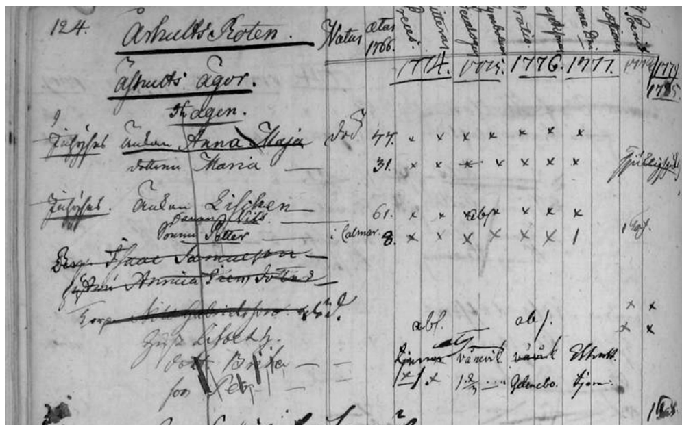
A picture from Döderhults first busförbörslängd (AI:1 1766-1799)