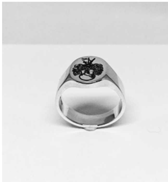
Signet ring model 1